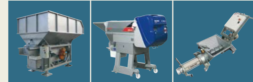
Delta AEV vibrating hopper