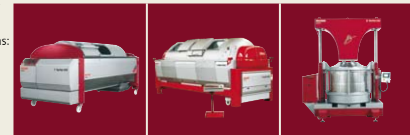
Bucher XPC 50 pneumatic press

Basket presses: from 5 to 20 hl - Parts in contact with grapes or juice made of stainless steel - Automatic* demoulding of pomace-cake - Control panel with modifiable programs