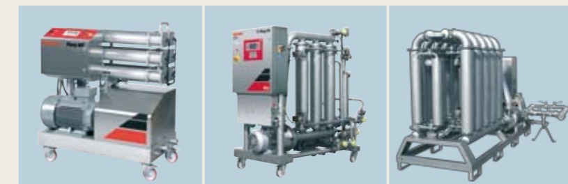
Flavy MT must concentrator

* in accordance with current local regulations